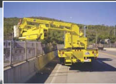
•RIGHT & LEFT DEPLOYMENT